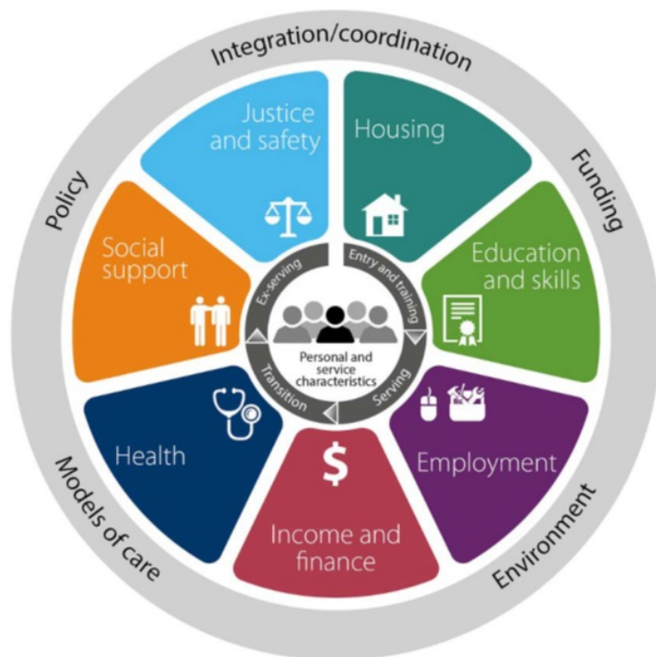
Figure 1: The Veteran-centred model

To date, AIHW has used this model to inform the AIHW's veterans analysis work program, with analysis predominantly exploring the Health and Housing domains. Through data linkage, analysis of four additional domains has been undertaken to investigate factors that influence the wellbeing of ex-serving ADF members and their families, including the Education and skills, Employment, Income and finance, and Social support domains. These domains align closely with high-level wellbeing factors currently in use by DVA, as described in their Veteran Mental Health and Wellbeing Strategy and National Action Plan 2020-2023 .