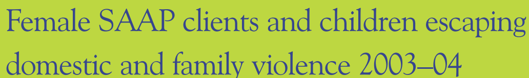
Table A13 shows the number of support periods for women in the SAAP domestic violence group with accompanying children according to cultural and linguistic diversity. Overall, women in the SAAP domestic violence group who had accompanying children were most likely to present with one accompanying child (in 39% of support periods) followed by two accompanying children (in 31% of support periods).

Indigenous women were more likely to have four or more accompanying children than other cultural groups (15% of support periods compared to between 9% and 14%). Women from predominantly non-English-speaking countries were more likely to have just one accompanying child than other cultural groups (44% of support periods compared to between 35% and 39%).