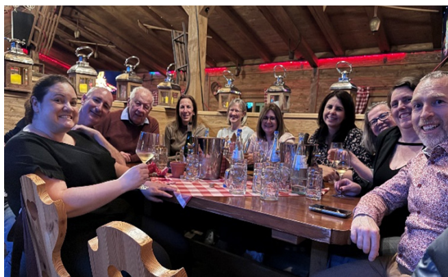
WHO-FIC ACC Dinner