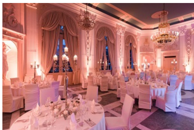
La Redoute restaurant