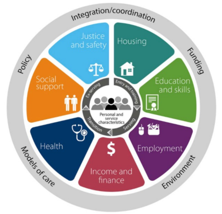
Figure 1: The Veteran-centred model

To date, AIHW has used this model to inform the AIHW's veterans analysis work program, with analysis predominantly exploring the Health and Housing domains. Through data linkage, analysis of four additional domains has been undertaken to investigate factors that influence the wellbeing of ex-serving ADF members and their families, including the Education and skills, Employment, Income and finance, and Social support domains. These domains align closely with high-level wellbeing factors currently in use by DVA, as described in their <u>Veteran Mental Health and Wellbeing Strategy and National Action Plan 2020-2023</u>.