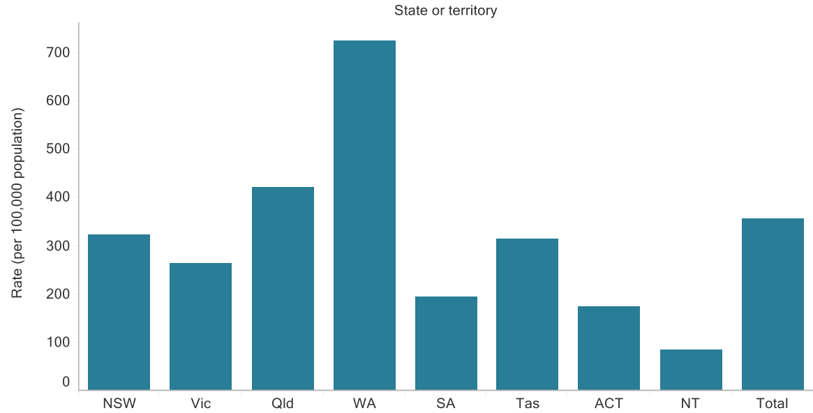
Figure MBS.1: MBS-subsidised palliative medicine specialist services, by states and territories, rate per 100,000 population, 2018-19

Note: Crude rates are based on the preliminary Australian estimated population as at 31 December 2018