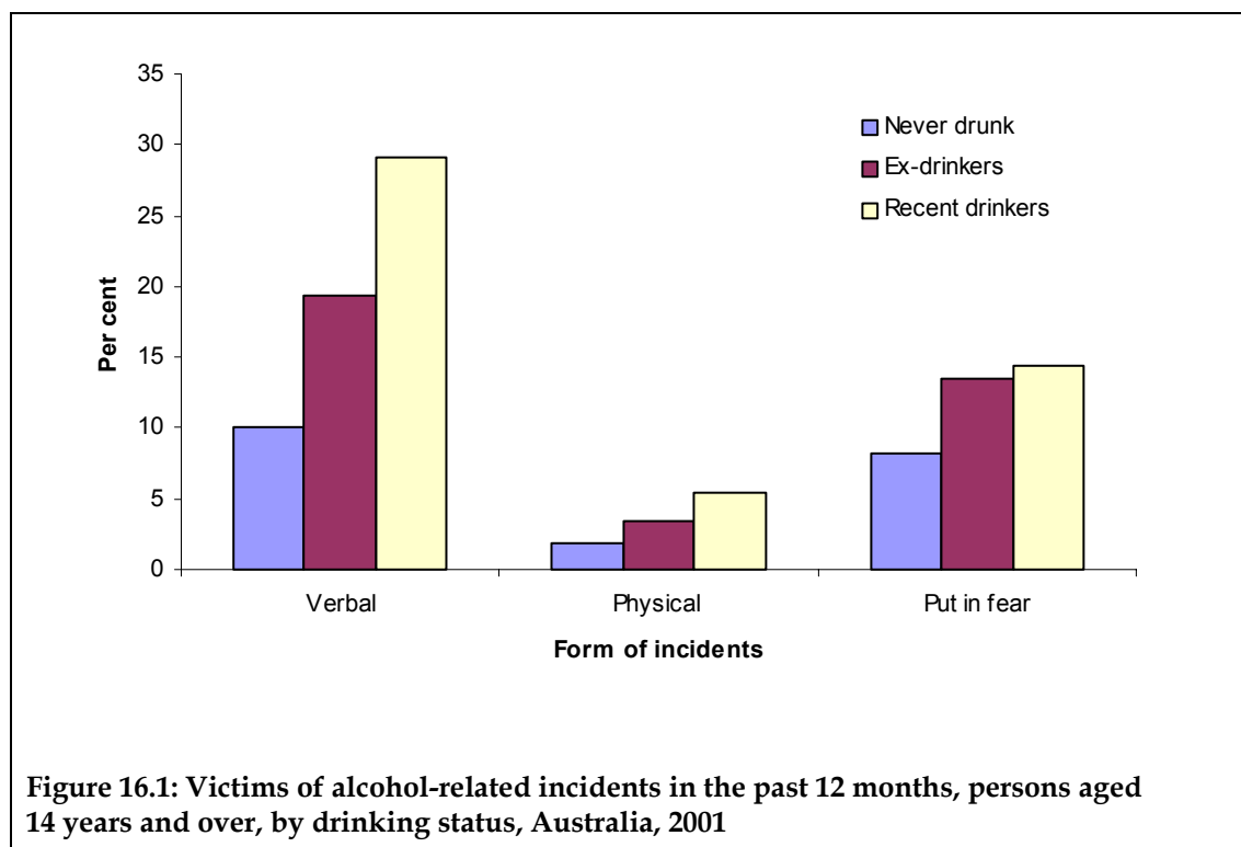
Figure 16.1: Victims of alcohol-related incidents in the past 12 months, persons aged 14 years and over, by drinking status, Australia, 2001