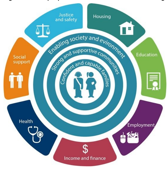
Figure 2: AIHW people-centred data model and an ecological approach to the wellbeing of young people

Currently, data are mostly available from separate and disconnected sources. This makes it difficult to undertake regular national reporting on many topics that cut across different domains-such as physical and mental health within the context of education or work, homelessness or unstable housing, or of young people in the justice system. Regular national reporting on such cross-cutting themes requires regular national multi-sectorial data linkage. For more information, see <u>Data gaps</u>.