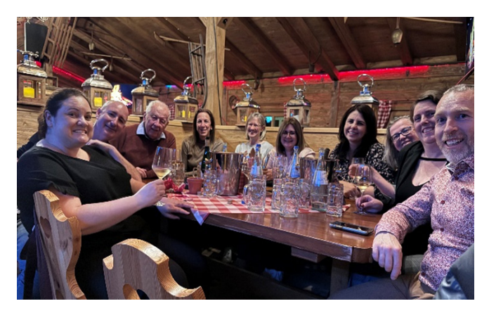
WHO-FIC ACC Dinner