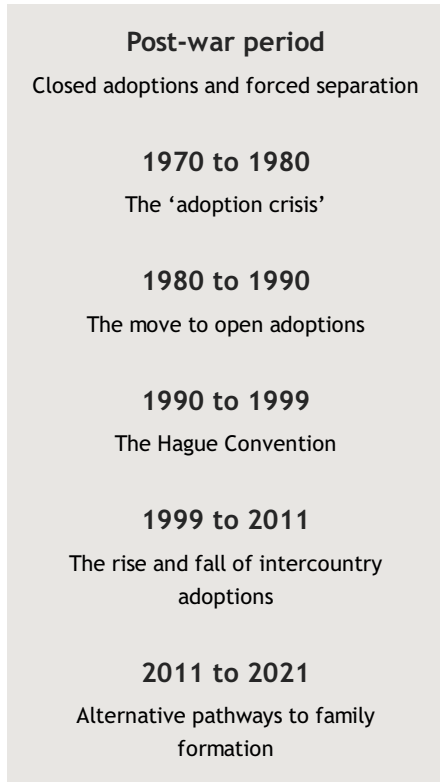
Figure 1: Number of adoptions and key moments in Australia, 1968-69 to 2021-22

This report explores how changing societal, legislative, and social views have affected numbers of adoptions over the last 53 years (Figure 1). Trends in adoptions can be categorised into domestic adoptions of Australian children (local and known child adoptions) and children born overseas (intercountry adoptions).